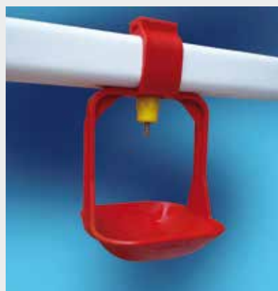
Small twin leg cup