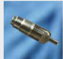
4077 Low Flow