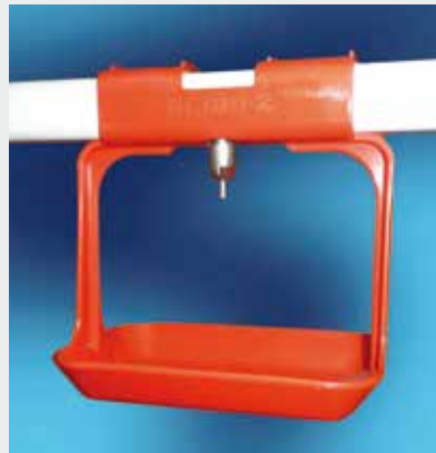
Large twin leg cup Adult layer breeders