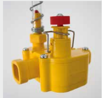
Variable slope pressure regulator