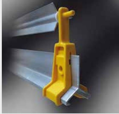
Anti perch spinner avoiding use of electric shocker