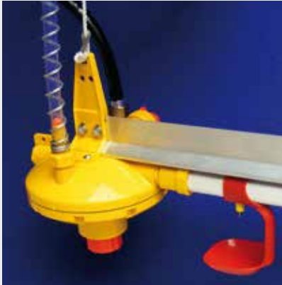
Beginning of the Line Pressure Reducing Kit - for the max control of the water flow