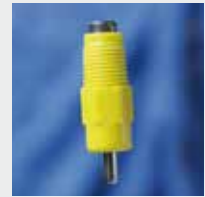
4078 Low Flow