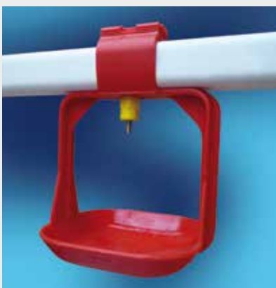
Medium twin leg cup