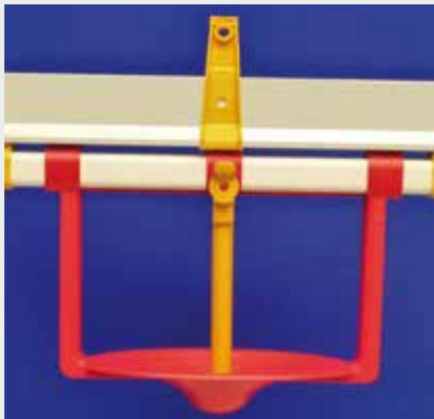
Turkey Nipple Line Drinker Suitable for all ages

joiners with metal clips - no glue is used. In line pre-set regulators can be installed where the floor has a slope. It is also possible to use electric winches.