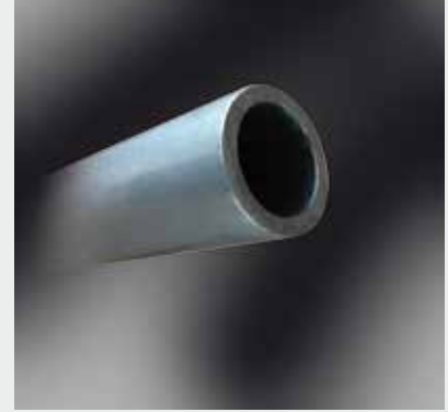
Drinker support conduit pipe for economic solution to perching