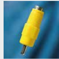
4024 High Flow

Plastic and Stainless Steel bodies with internal Stainless Steel mechanisms