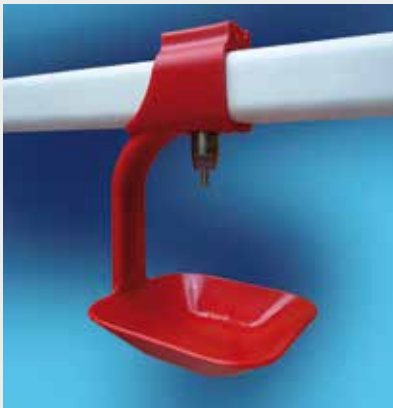
Single leg drinking cup The most popular in our range