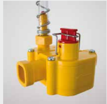
Fixed slope pressure regulator