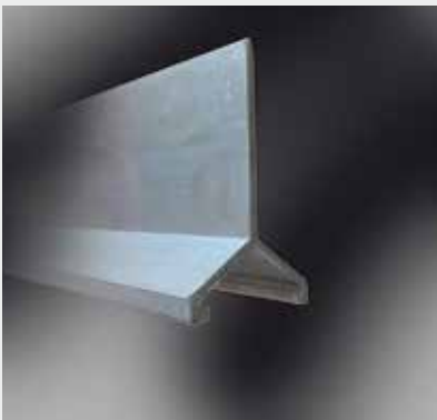
Profile for non perching commonly used for broiler production