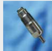
4022 High Flow